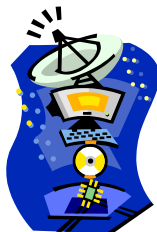
Infection control !